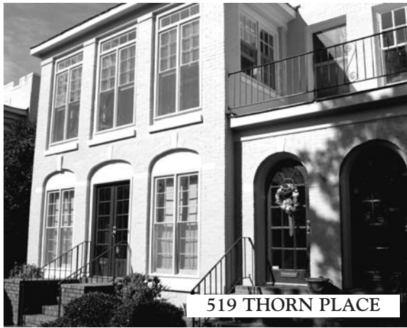
519 THORN PLACE