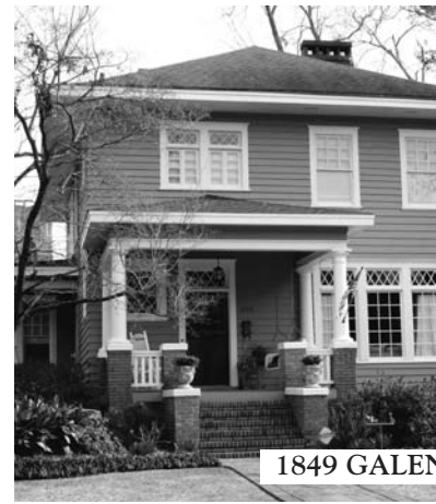
1849 GALENA AVENUE