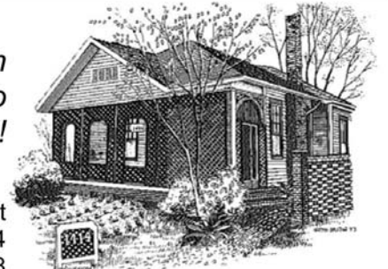
The Lattice Inn

1414 South Hull Street Montgomery, AL 36104 334.262.3388 www.thelatticeinn.com