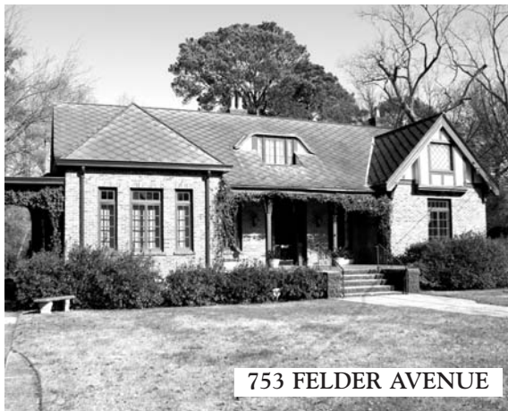
753 FELDER AVENUE