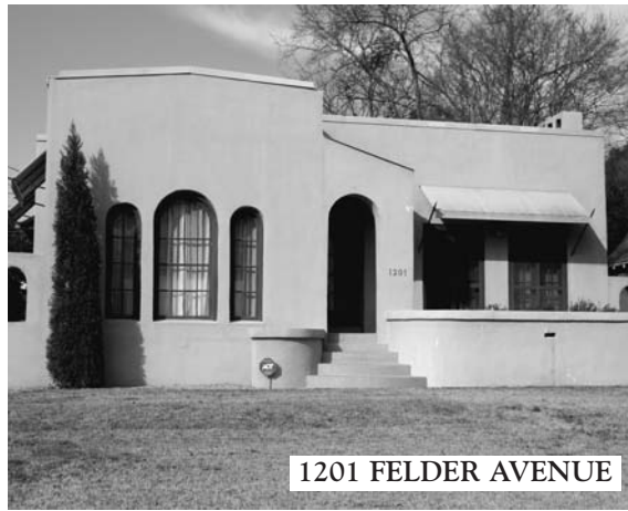
1201 FELDER AVENUE

•Mark Your Calendars: The Fifth Annual Old Cloverdale Tour of Homes and Gardens is scheduled for Saturday, April 4, 2009. In preparation for this event, please do your part by sprucing up your yard and surroundings. Lots of people visit us during this tour and we want the entire neighborhood to shine. We hope to see you there!